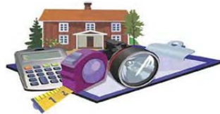
2 When you buy a house, there are so many _____