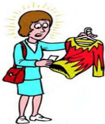
1 The _____ is just too expensive.