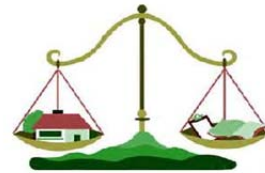
3 Most people have trouble balancing the _____