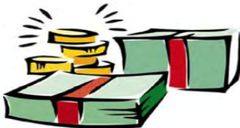
6 We've got a lot of _____ to spend.