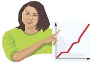
4 We had a big _____ this year.