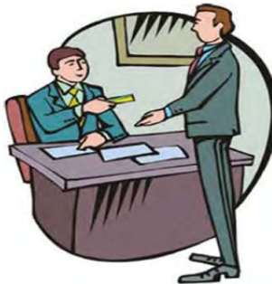
7 I get my _____ at the end of every month.