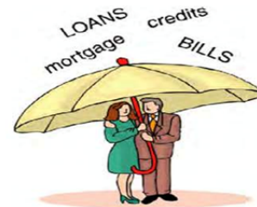
8 We are really in _____ now.